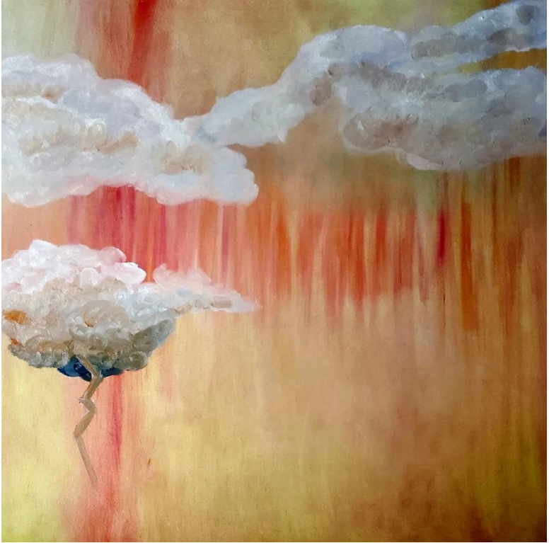
Mary Leonard's Testimonies Collection Happy Little Clouds – Oil, 36” by 36”